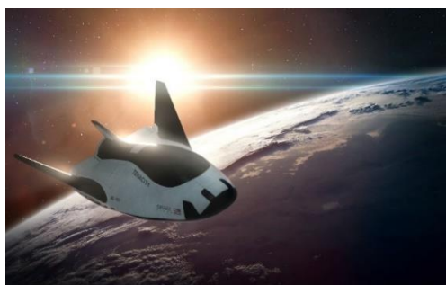
Dream Chaser Spaceplane

Japan Airlines Co., Ltd., Kanematsu Corporation, Oita Prefecture, MUFG Bank, Ltd., Tokio Marine & Nichido Fire Insurance Co., Ltd., Sierra Space Corporation, and Space Port Japan Association have been participating in a partnership to explore the use of the Dream Chaser ® spaceplane and are working together to utilize Oita Airport as an Asian base for the Dream Chaser spaceplane.